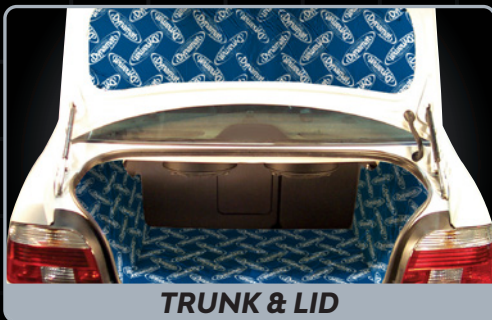
TRUNK & LID